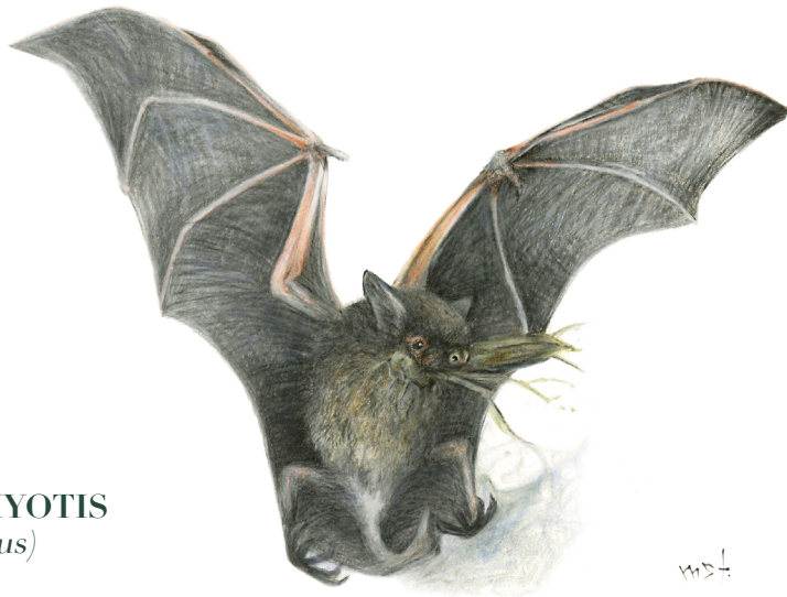
SOUTHERN MYOTIS ( Myotis macropus )