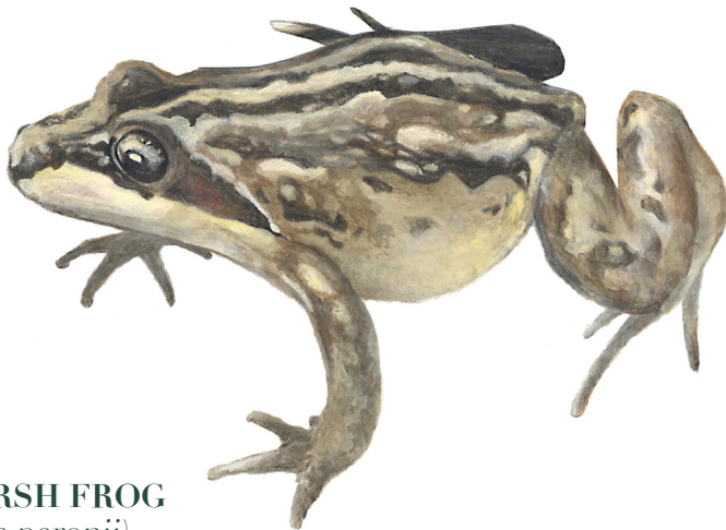
STRIPED MARSH FROG ( Limnodynastes peronii )