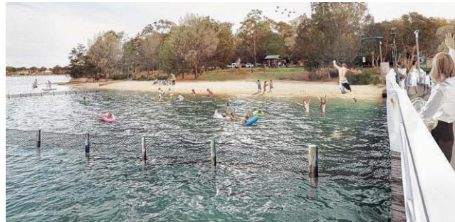
A concept plan of the Bayview Park swim site in Concord.

The plans state the seven-year target will require a “10-step” approach involving co-operation between multiple state government departments, developers and local councils.