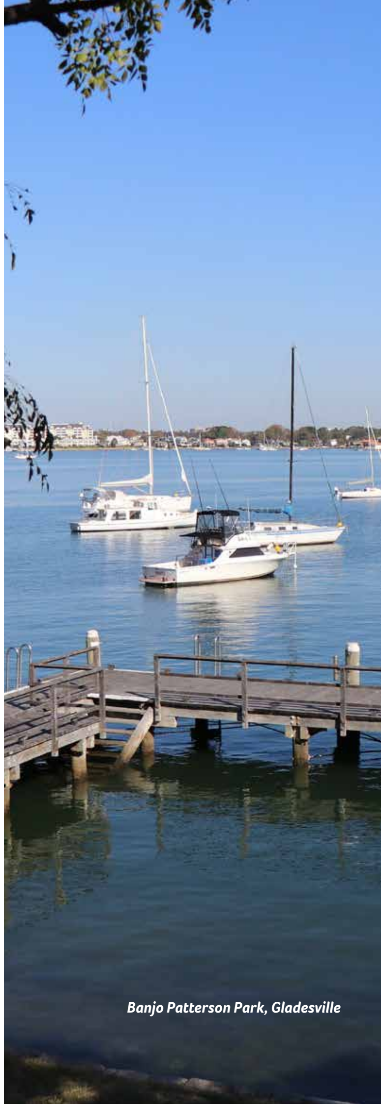
Banjo Patterson Park, Gladesville