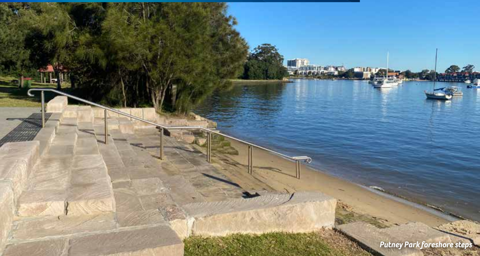
Putney Park foreshore steps

Establishing the pathways to make the river swimmable again through the implementation of the Parramatta River Masterplan.