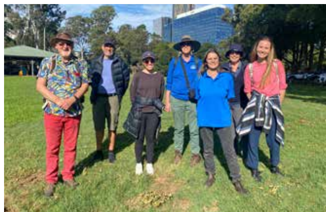
Parramatta River Heritage Walking Tour.

The purpose of the project is to develop a design framework that will assist councils with creating cultural public works that offer the community more meaningful ways to connect with and help care for Country (see report on page 10).