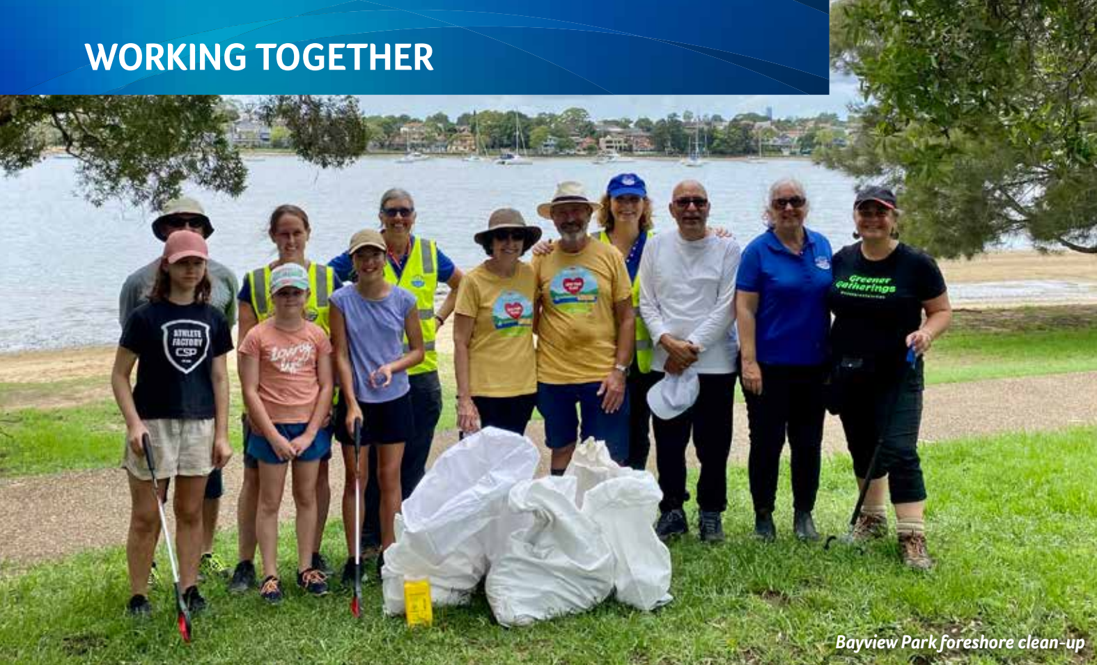
Bayview Park foreshore clean-up

Coordinating collaborative efforts across our network to deliver positive outcomes for the Parramatta River in a more efficient and effective way.