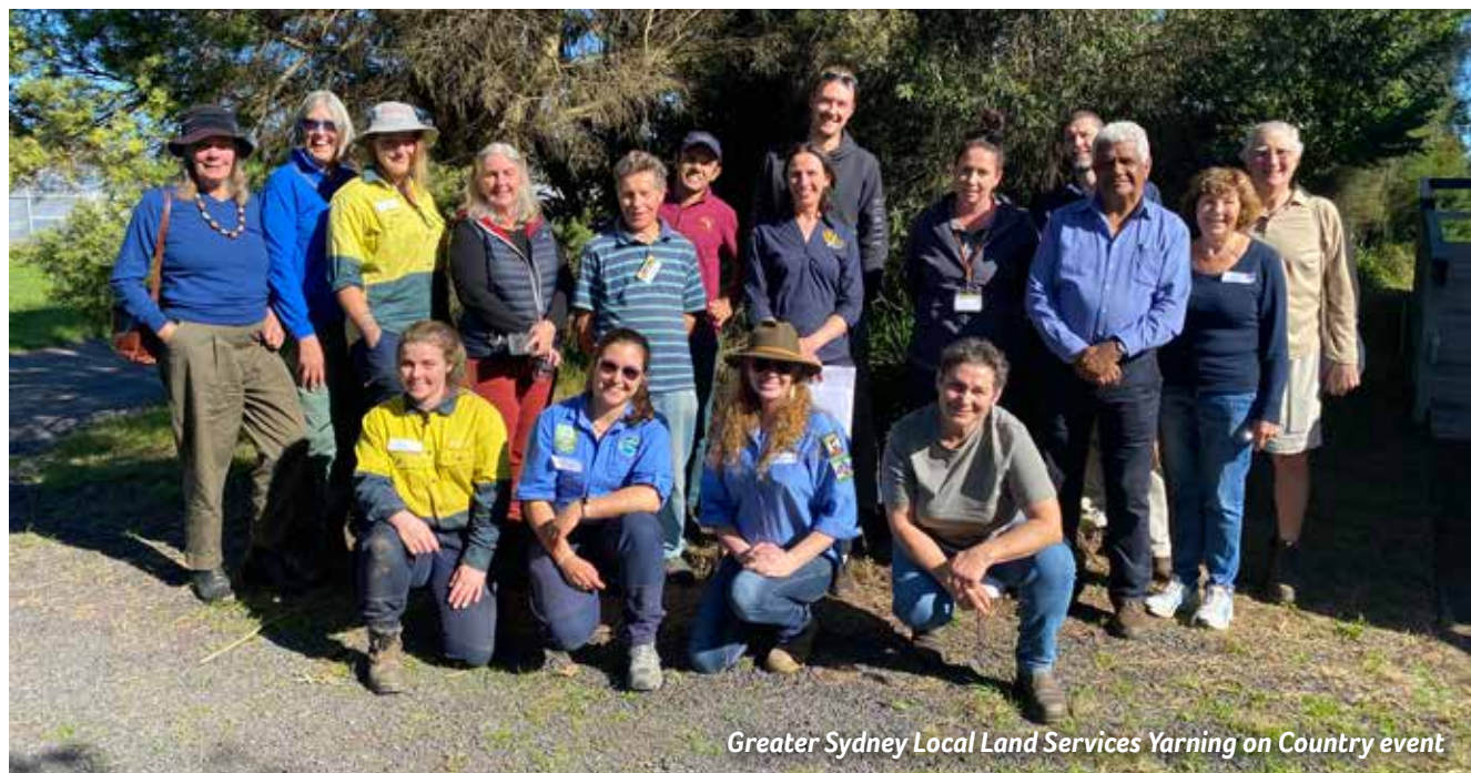
Greater Sydney Local Land Services Yarning on Country event