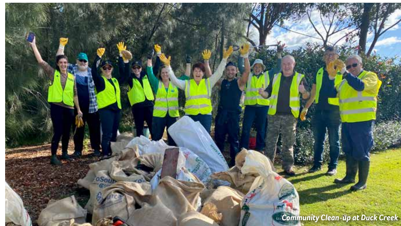
Community Clean-up at Duck Creek

Joint community education efforts to help reduce source pollution in stormwater runoff continue through initiatives such as the 'Love Your Waterways' community awareness campaign and 'Get the Site Right' education and compliance blitz, now in its seventh year (see full report on page 17).