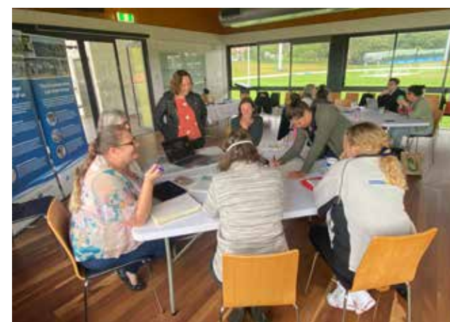
Biodiversity and Education Subcommittee Workshop.

The PRCG joined City of Canada Bay and local community groups for a clean-up of the Bayview Park foreshore. Volunteers moved bricks and other historic building waste from the shoreline at low tide in preparation for the construction of the new swimming enclosure.