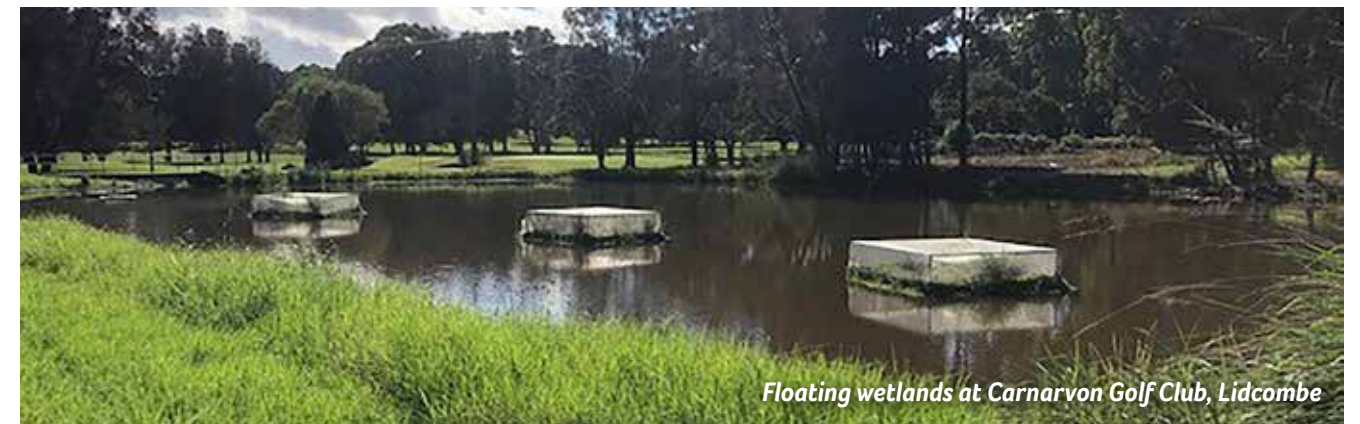
Floating wetlands at Carnarvon Golf Club, Lidcombe

Joint advocacy with our partners on issues affecting the river and catchment helps provide a united voice for our communities and waterways.