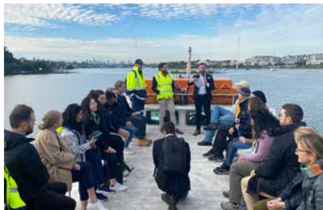
Sydney Water boat tour of the Parramatta River and laboratory services site visit.

Regen Melbourne: Relationships established through the Biennale of Sydney events led to discussions with community-based platform Regen Melbourne on improved liveability and sustainability for our cities. In June, the PRCG and Sydney Water presented on the Parramatta River Masterplan at an online forum hosted by Regen Melbourne, which focused on swimmable cities and communities around the world.