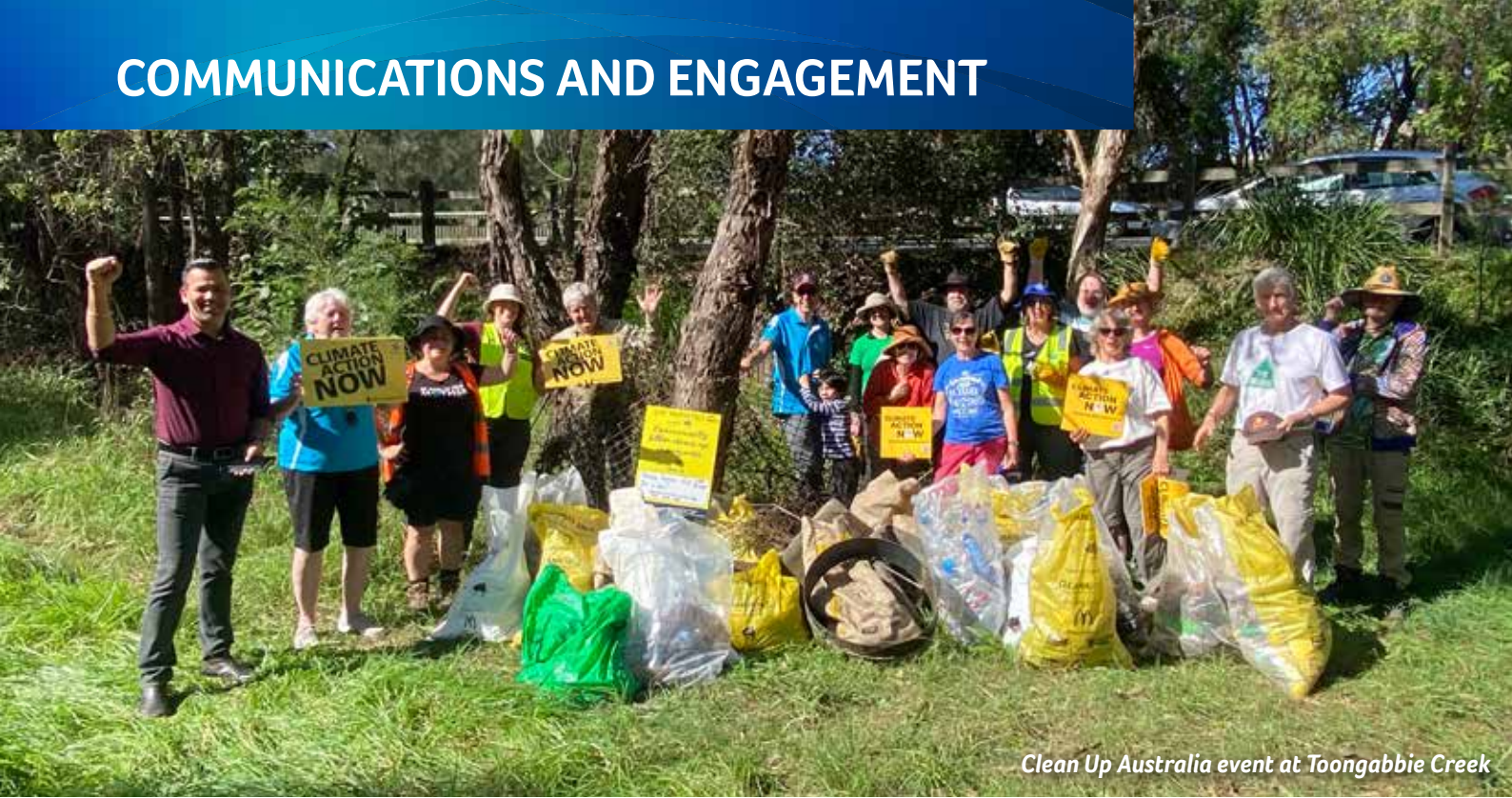
Clean Up Australia event at Toongabbie Creek

The success of our mission to make the Parramatta River swimmable again relies heavily on regular face-to-face and online communications and engagement with our communities.