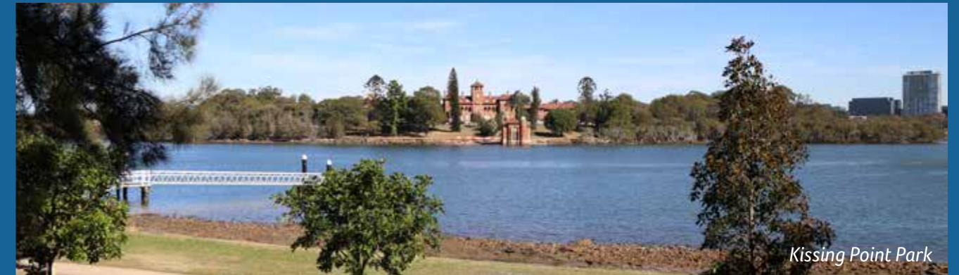
Kissing Point Park