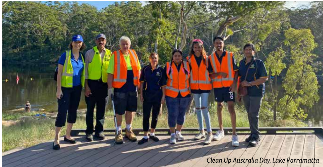
Clean Up Australia Day, Lake Parramatta