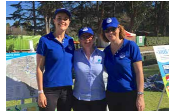
2019 Cherry Blossom Festival