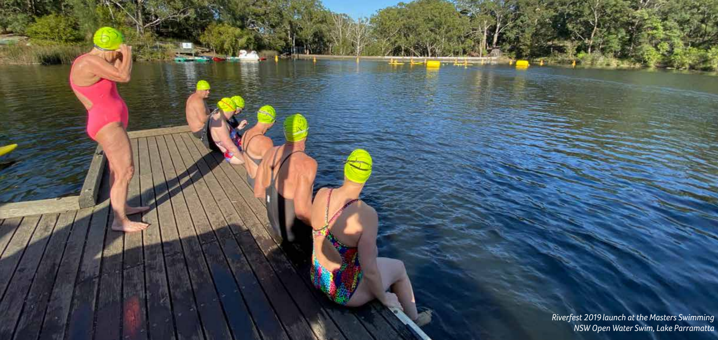
Riverfest 2019 launch at the Masters Swimming NSW Open Water Swim, Lake Parramatta