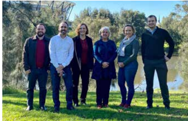
PRCG and Sydney Water Delivery Engine teams

TfNSW Maritime Environmental Services: joined the Stormwater Subcommittee where they have shared litter collection data and are working to identify other opportunities for litter collection and removal from the Parramatta River.