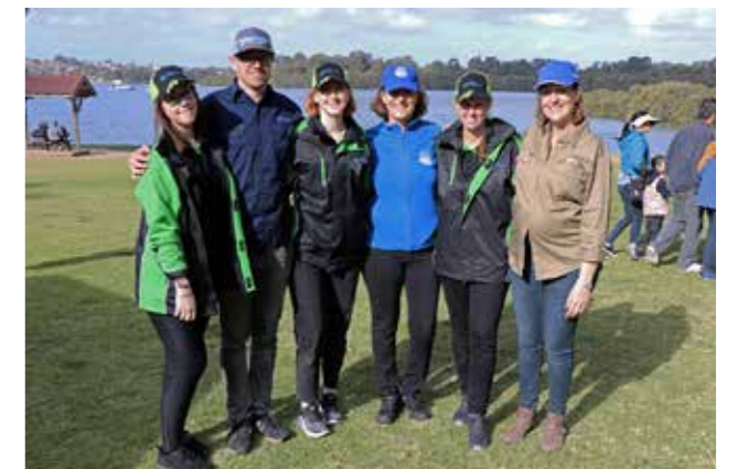
Mcllwaine Park Riverside Community Day