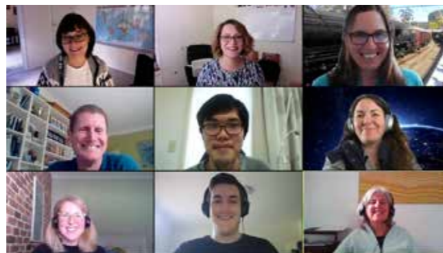
Macquarie University Masters students' presentations

The PRCG attended National Tree Day events held by our partner councils.