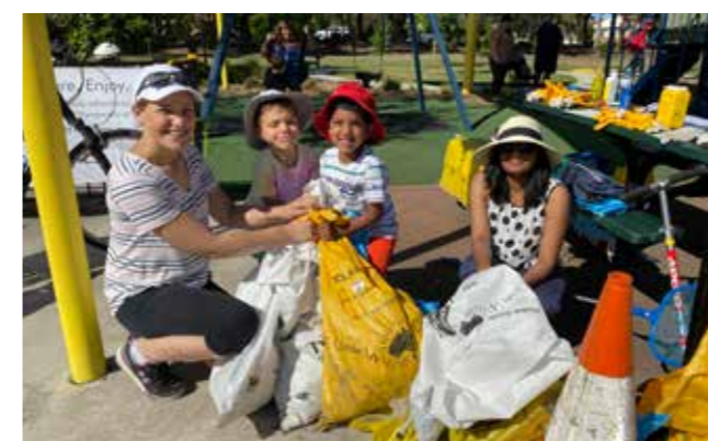
ParraParents foreshore clean-up at Rydalmere