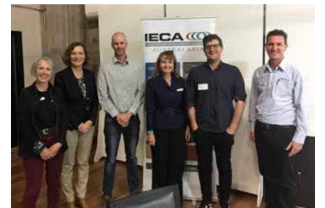
IECA Aust. Council Compliance Workshop