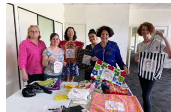
City of Canada Bay's Boomerang Bags workshop