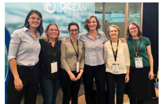
2019 Stormwater NSW Conference