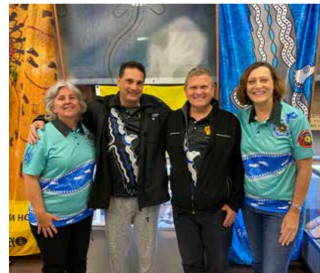
Murama Healing Space and PRCG teams

Get the Site Right: Regulatory staff from all catchment councils were invited to attend training in erosion and sediment control. There were twenty five places available across all partner groups and six PRCG member councils were funded to attend.