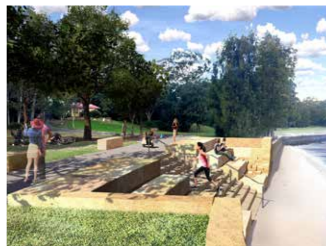
Artist's impression of Putney Park site activation

Key decision makers at NSW Health, DPIE and members of the Swim Site Activation Technical Working Group endorsed a Human Health Risk Assessment Framework to support the chemical assessment at priority swim sites.