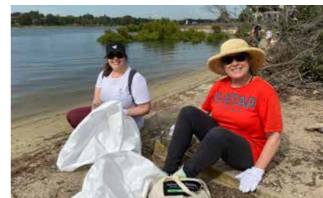
City of Canada Bay's Spring Clean for the Shorebirds