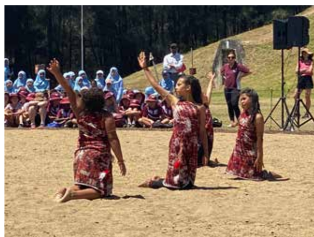
Opening of the Murama Healing Space Dance Ground

The PRCG collaborated with the Murama Healing Space to plan projects, attend events and participate in a video for National Reconciliation Week.