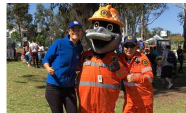
Resilient Blacktown Community Picnic Day