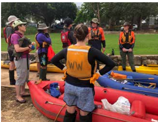
Lake Parramatta Bushcare

The River Aware residential stormwater awareness campaign was launched through social media platforms in May, and was well-received reaching more than 4,000 people. Interest from other Sydney catchment groups has resulted in a joint River Aware campaign being planned for March 2021.