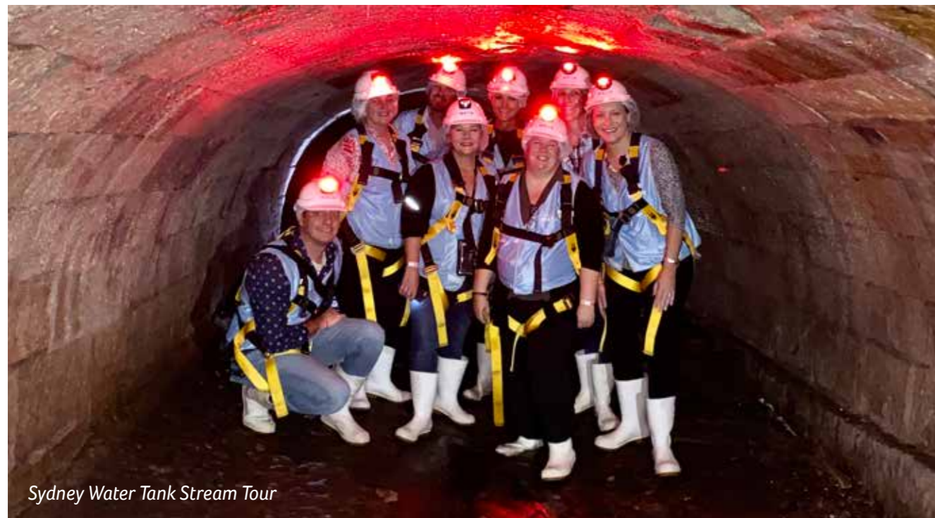
Sydney Water Tank Stream Tour