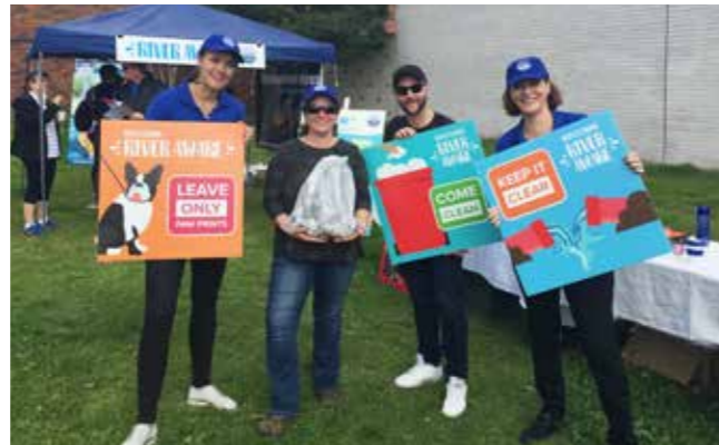
River Aware pilot launch

Due to COVID-19, many community events and campaigns scheduled for the first half of 2020 were unable to proceed as planned. However, the PRCG continued to engage with our various community groups through online campaigns, meetings and workshops.