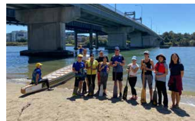
DSA – Dragon Sports Association's Community Open Day