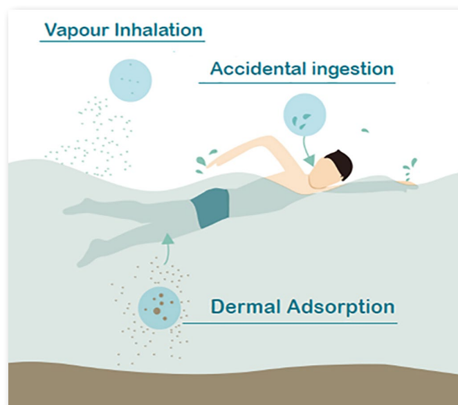
Example of the exposure pathways for an adult swimming.

The exposure assessment is a critical and complex area of the risk assessment. It requires decisions to be made about the magnitude, frequency, extent, character and duration of exposure to chemicals. The assessment must also consider the range of exposed populations (e.g. children playing, adults swimming) and potential exposure pathways for each.