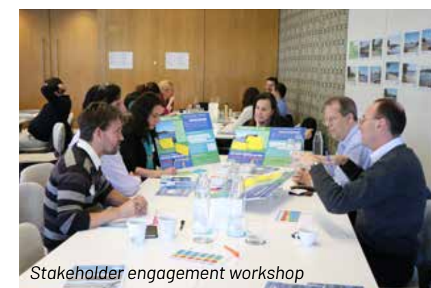
Stakeholder engagement workshop