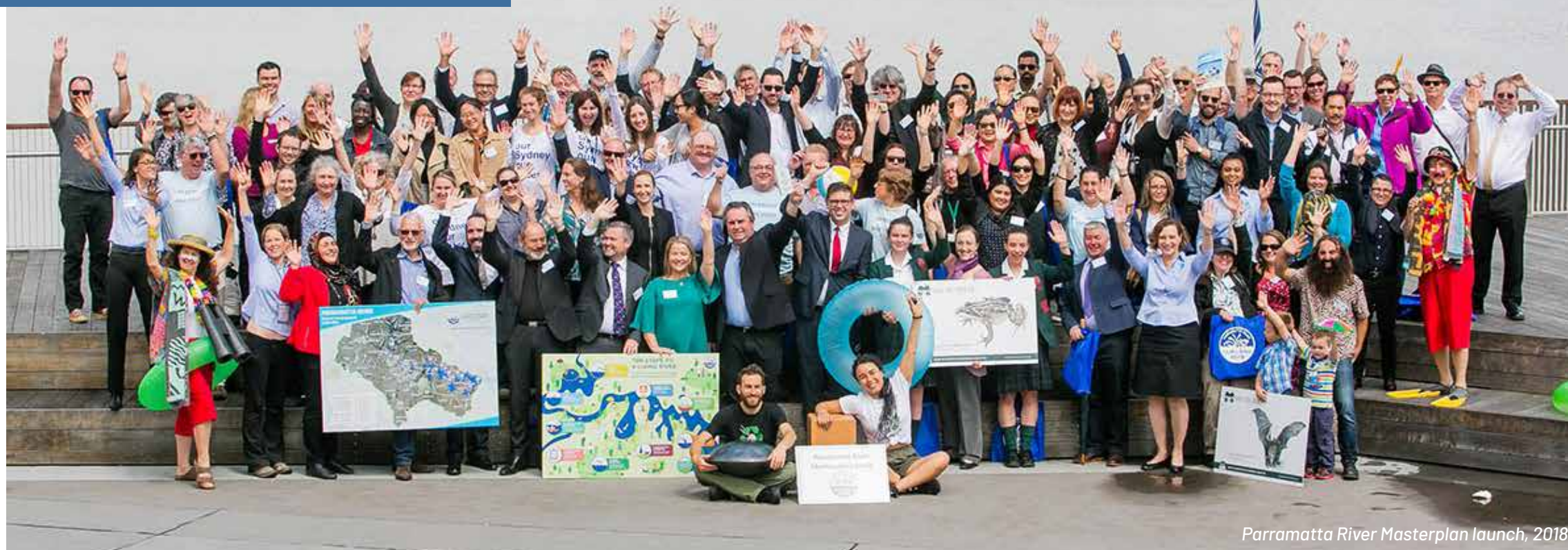
Parramatta River Masterplan launch, 2018