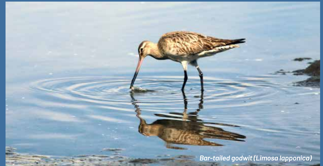
Bar-tailed godwit ( Limosa lapponica )

The Parramatta River Bank Naturalisation and Planning of Priority Corridors project, funded by the NSW Government, aims to improve waterway health by identifying priority areas for revegetation, delivering on-ground works, and guiding priority restoration planning.