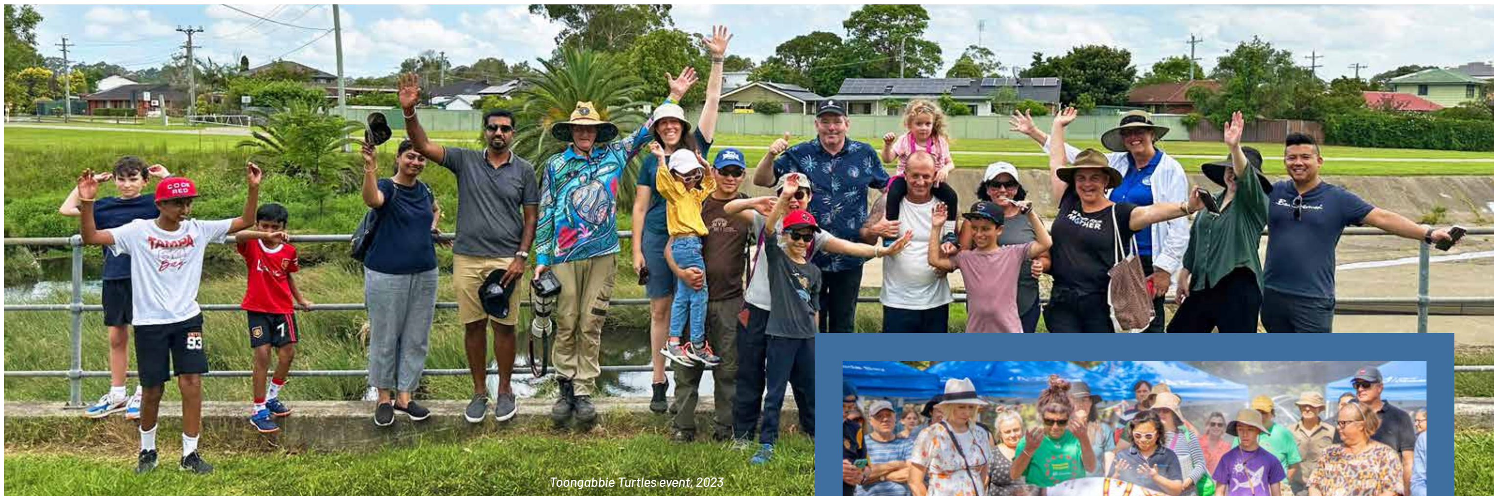
Toongabbie Turtles event, 2023