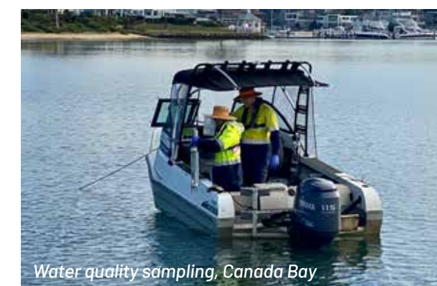
Water quality sampling, Canada Bay

Through these efforts, we are fostering more sustainable and resilient communities, ensuring that the Parramatta River and its catchment continue to support people, nature, and culture for generations to come.