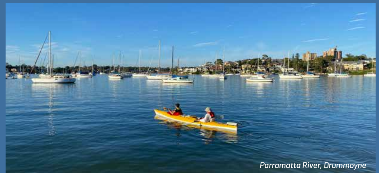
Parramatta River, Drummoyne

The WSUD Uplift project advances the strategic and statutory planning reform by streamlining planning controls, embedding measurable water quality targets, and promoting consistent compliance and education. This ensures that both new developments and existing infrastructure contribute to healthier waterways.