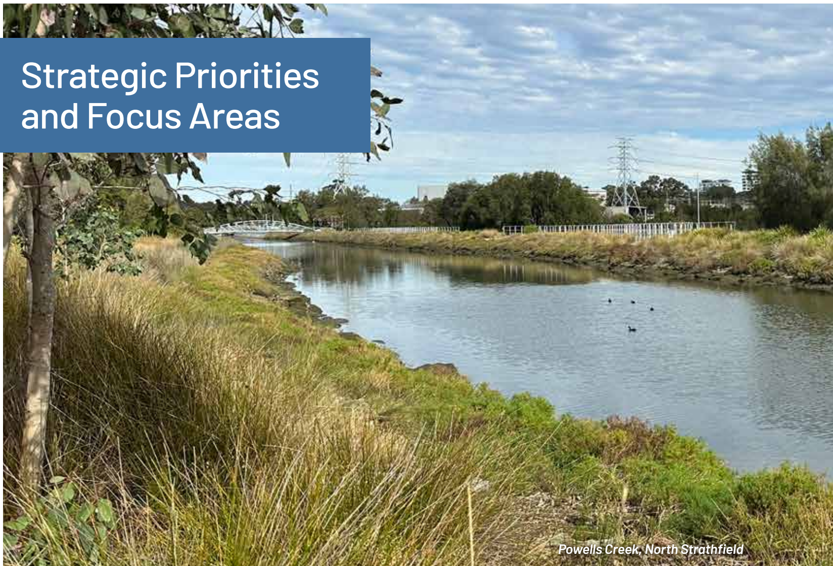
Powells Creek, North Strathfield