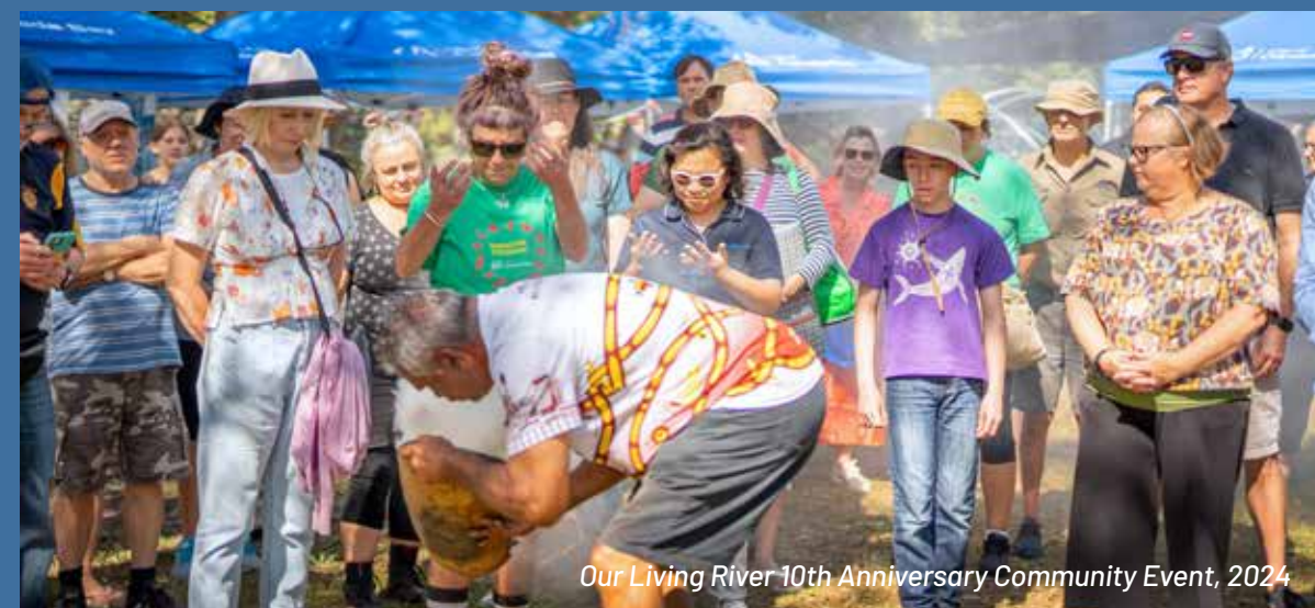
Our Living River 10th Anniversary Community Event, 2024

The PRCG also supports education and engagement initiatives delivered by member councils and community groups, including clean-up events, bushcare, workshops, and sustainability festivals.