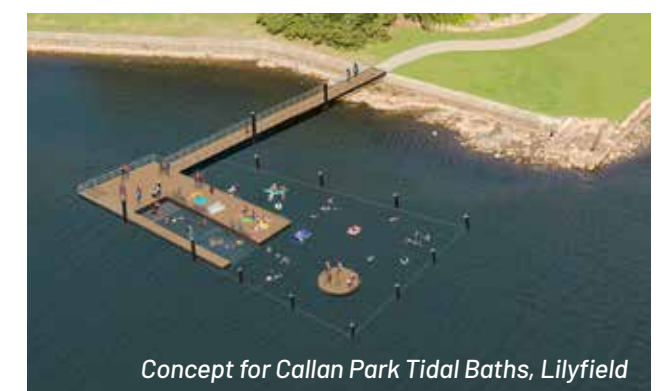
Concept for Callan Park Tidal Baths, Lilyfield