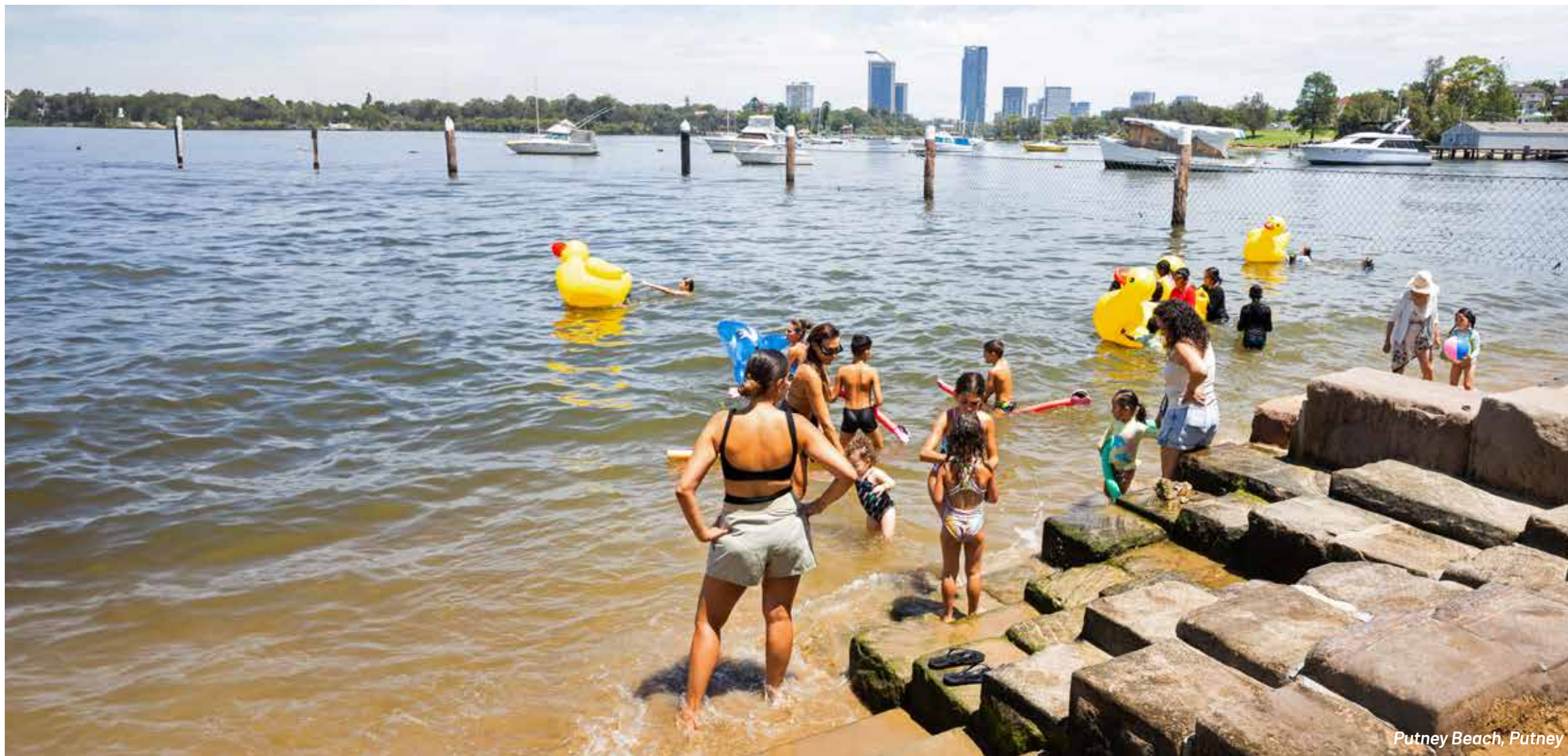
Putney Beach, Putney