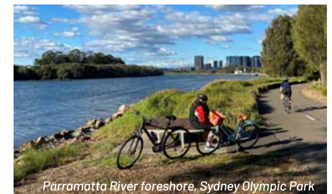
Parramatta River foreshore, Sydney Olympic Park

The PRCG is proud to be a founding signatory of the Swimmable Cities Charter, strengthening our leadership in this space and building on the global movement to create clean, swimmable urban rivers that are central to city life and accessible to all.