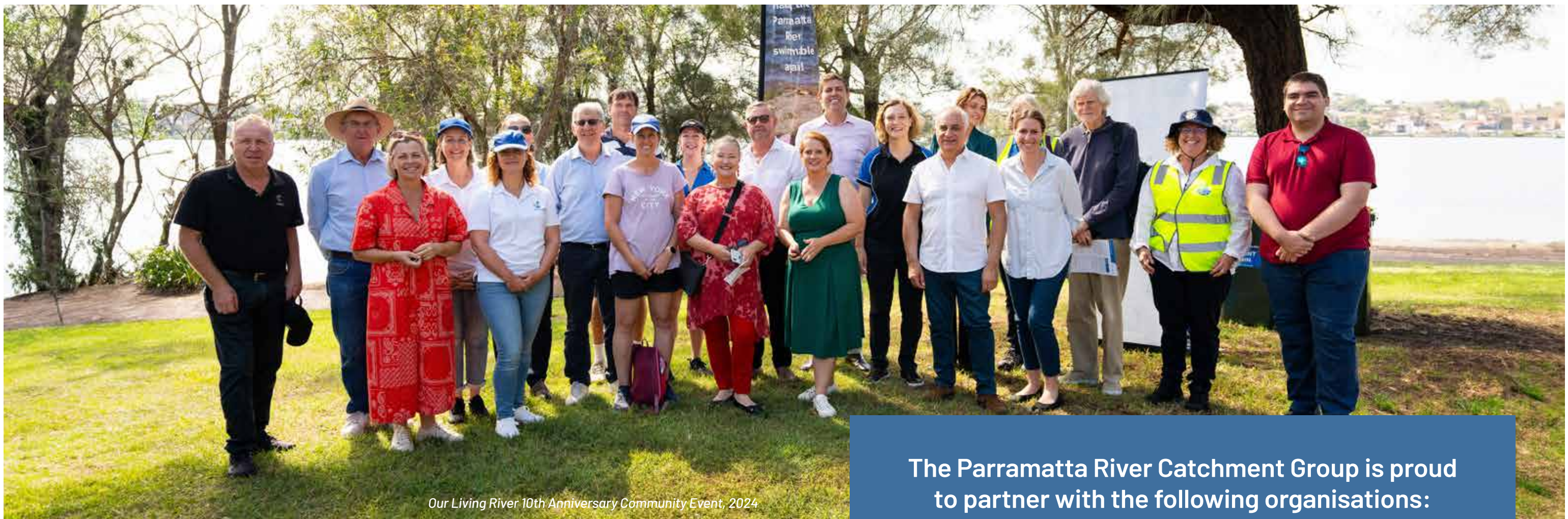
Our Living River 10th Anniversary Community Event, 2024